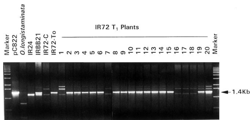
Fig. 2 PCR analysis of transgenic T 1 plants. The arrow marks the expected 1.4-kb Xa21 -specific DNA fragment which was amplified by primer pair U1 and I1 (Fig. 1). O. longistaminata , 'IR24', IRBB21, 'IR72'-C, 'IR72'-T 0 and 'IR72' T 1 plants represent Xa21 's original donor species, susceptible parental line, susceptible line-derived Xa21 introgression line, nontransgenic control plant, transgenic primary plant, and transgenic progeny plants, respectively. pC822 The plasmid containing Xa21 used to generate transgenic line T103. The PCR products were separated in 1% agarose gel. Markers in the first and last lane were labeled by a 1-kb ladder.

I1 that specifically amplified a 1.4-kb DNA fragment from the 3' nontranslated region to the center of intron of Xa21 was used for this purpose. A DNA fragment of the expected size was amplified from cloned pC822, donor line IRBB21, a primary transgenic plant, and from 15 of the 20 T 1 plants (Fig. 2). This is consistent with a single locus insertion into the rice genome of the primary transgenic line T103 which segregated into a 3:1 ratio. In subsequent experiments, these results were further confirmed by Southern blot analysis (Fig. 3).