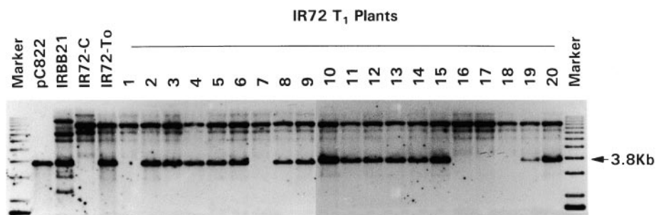
Fig 3 Southern analysis of transgenic T 1 plants. A total of 5 µg plant genome DNA and 30 pg of plasmid DNA were digested with EcoRV and hybridized with the same enzyme-digested plasmid DNA fragment. The arrow marks the expected 3.8-kb hybridizing band, which appeared in the plasmid, Xa21 -donor line, and positive transgenic T 0 and T 1 plants. IRBB21, 'IR72'-C, 'IR72'-T 0 , and 'IR72' T 1 plants represent Xa21 introgression line, nontransgenic control plant, transgenic primary plant, and transgenic progeny plants, respectively. pC822 The plasmid containing Xa21 used to generate transgenic line T103. Markers in the first and last lane were labeled by a 1-kb ladder