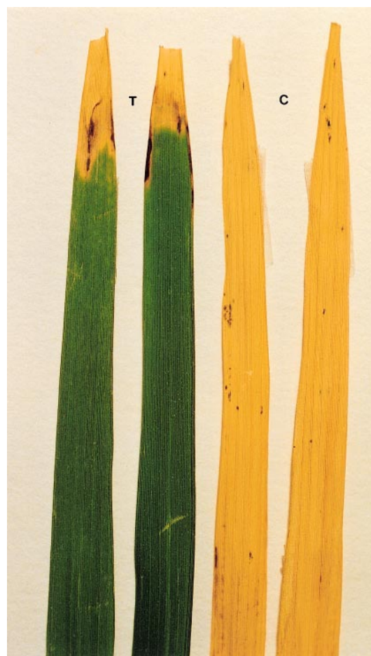
Fig. 4 Resistant reaction of transgenic plants to strain PX099 of Xoo race 6. Photograph taken 15 days after inoculation. T: Leaves from transgenic T 1 plant T103-15, C leaves from nontransgenic 'IR72' control plant

Through artificial inoculation, it was observed that the level of resistance of the transgenic plants to Xoo race 4 was higher than that of the control plants of